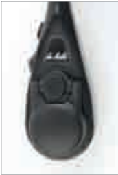
Battery cover closed

The hearing aid is turned off by simply opening the battery cover.